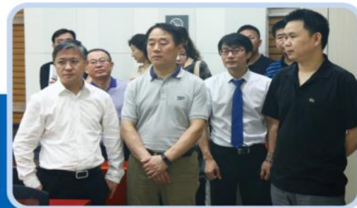
湖南省政协副主席胡旭晟(左一)采访