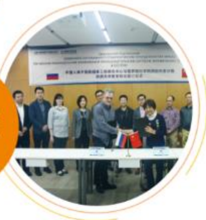
俄罗斯科学院西伯利亚 分院与光瑞生命人类干 细胞国家工程研究中心 签订战略框架协议。