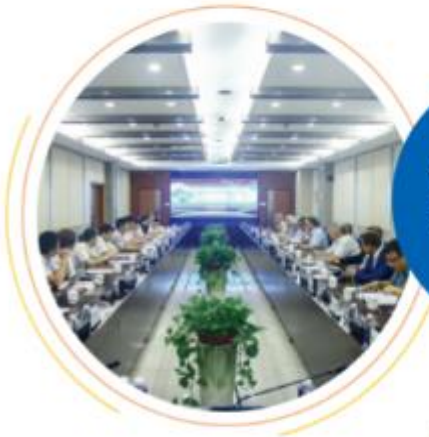
俄罗斯西伯利亚科学院 专家团与园区企业技术 交流对接会

...is an plan to promote commerce, trade, culture and tourism between business and organisations in Hunan Province (and Changsha) and with the Counties of the East Midlands